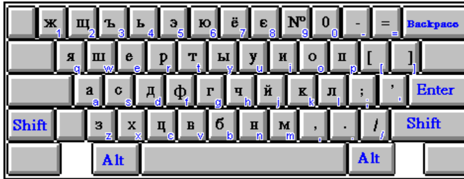
Serbian Cyrillic "Default" Keyboard Layout Uppercase "Pravda" Cyrillic TrueType Font